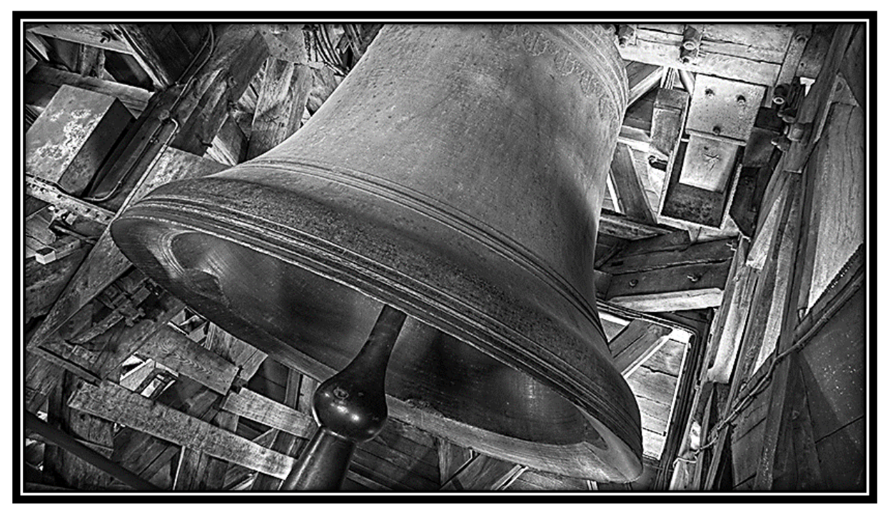
Middle Ages instructions for sung masses included the use of bells to double the tenor line, which carried the tune.

During the later Middle Ages, the pipe organ ousted wind instruments, strings, harps and bells, and it is likely that bells were relegated to cupboards and boxes, perhaps in the towers (note the irony!), to be rung again during the 16^{th} and 17^{th} centuries by tower bell ringers.